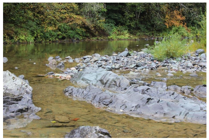
You can see the altered basalt dike in Quartzville Creek bed.

When the pluton rose through the basalt, which was laid down by eruptions millions of years before, it heated the old volcanic rock again. The heat and the fluids altered the basalt into rock with a different appearance. The rock takes on a denser appearance, and a greenish color. This can be seen several places along the creek, perhaps most obviously in the creek bed at the place of which I have been speaking. One can observe this different rock as a light green dike of rock on the sides and presumably under the stream.