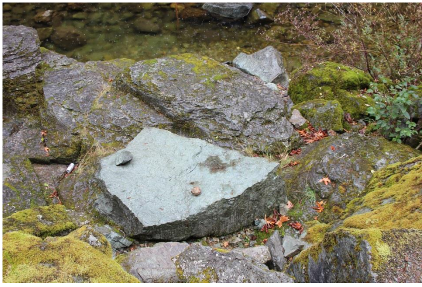
Note the different types of rocks. I would label these andesite and altered basalt

Eventually, about 12 million years ago, the volcanos of the Cascades resumed their eruption, but this time their eruption was further east, forming the modern High Cascades. (Compare illustration A and B above.) One common explanation for this change is that the subsumed ocean plate was more shallow. The reduced depth would mean that the plate would travel further under the North American plate before it became hot enough to melt and produce the volcanic eruptions that build the Cascades.