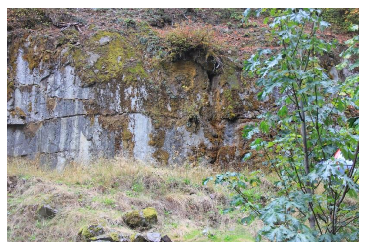
This is, I believe, a photo of the edge of a granite pluton

When the pluton rose through the basalt, which was laid down by eruptions millions of years before, it heated the old volcanic rock again. The heat and the fluids altered the basalt into rock with a different appearance. The rock takes on a denser appearance, and a greenish color. This can be seen several places along the creek, perhaps most obviously in the creek bed at the place of which I have been speaking. One can observe this different rock as a light green dike of rock on the sides and presumably under the stream.